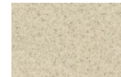
9800 Sliica Sand* w/r 9800