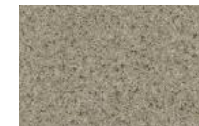
9802 Earth* w/r 9802