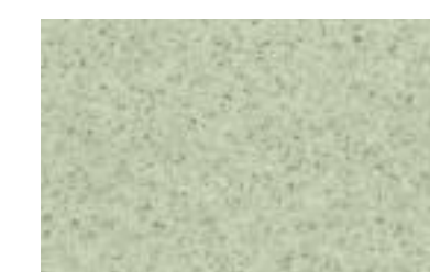
9809 Euclase Green* w/r 9809