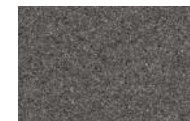
9805 Onyx* w/r 9805