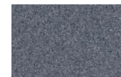
9808 Lazulite Blue* w/r 9808