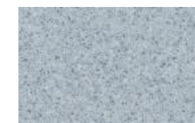
9806 Celestine Blue* w/r 9806