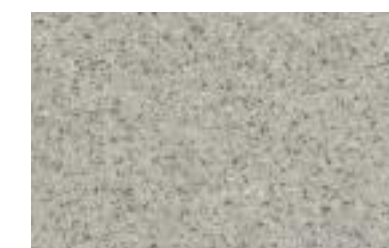
9804 Zinc* w/r 9804