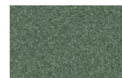
9810 Olivene Green w/r 9810